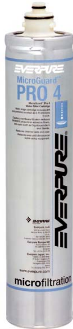
MicroGuard™ Pro 4 Replacement Cartridge: EV9637-02

Delivers premium quality drinking water for bottleless coolers and drinking fountains