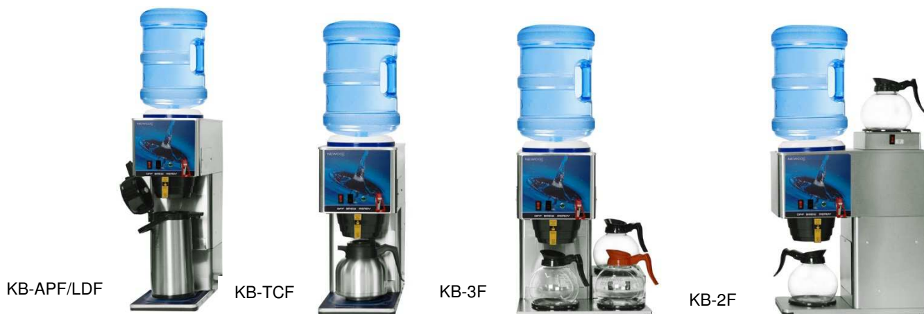
Vessels Not Included